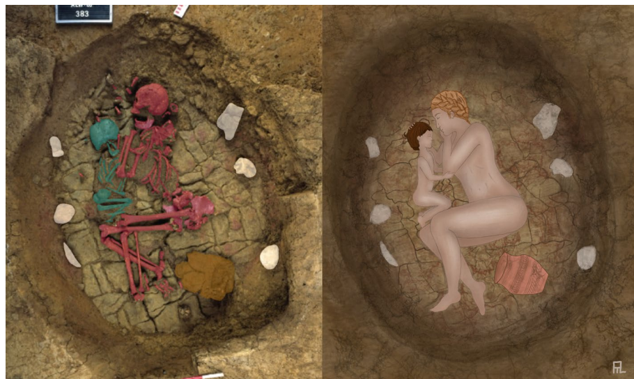
Figure 4. The grave of Altwies, left: the bones of the mother and child highlighted; right: hypothetical reconstruction of the grave based on phenotypic traits partly inferred from the ancient genomes.