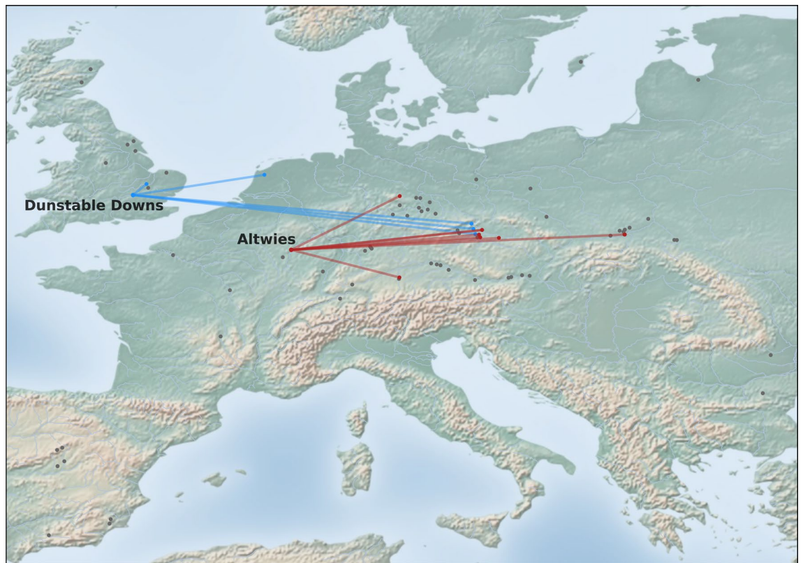
Figure 3. Location of Altwies “Op dem Boesch” (red dot) and Dunstable Downs (blue dot). Archaeological sites, in which individuals were found to share at least one IBD segment of \geq 16 cM with our newly reported genomes are shown in the same color. Sharing patterns are further highlighted by a vector line. Relevant third- and second-millennium BC adult-child graves are represented by grey dots. Adult-child graves from the Eurasian steppe belt are not depicted here. For a full list of burials and descriptions, see Table 2 and Supplementary Materials, Fig. S1. Matplotlib Basemap Toolkit 1.3.8 and Python 3.11 were used to produce the map. As map background, a display shaded relief image (from http://www.shadedrelief.com ) was used.