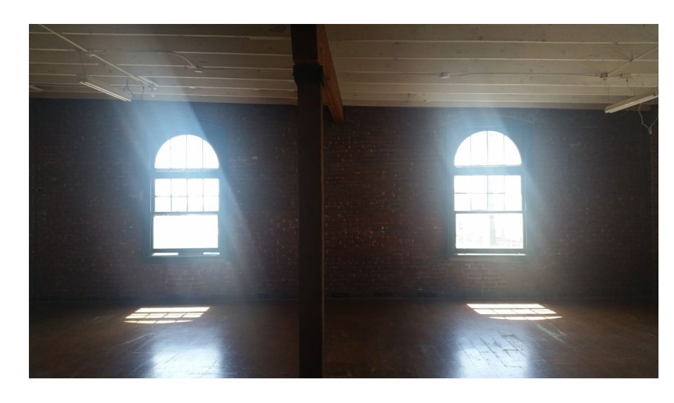
Fig. 3 Third floor of the Nate Starkman Building featuring wooden floors, brick walls and round-arc windows

on-screen representation where the atmosphere and feeling of a place matter just as any practicalities like accessibility or functionality.