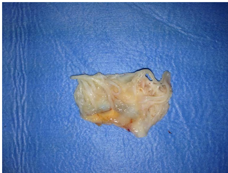
Figure 1 Myxomatous Mitral Valve Leaflet.

deficiency syndrome and other connective tissue disorders but can also be found in the elderly [5] which might allow the assumption of MMVD to be a symptom of ageing of the valve.