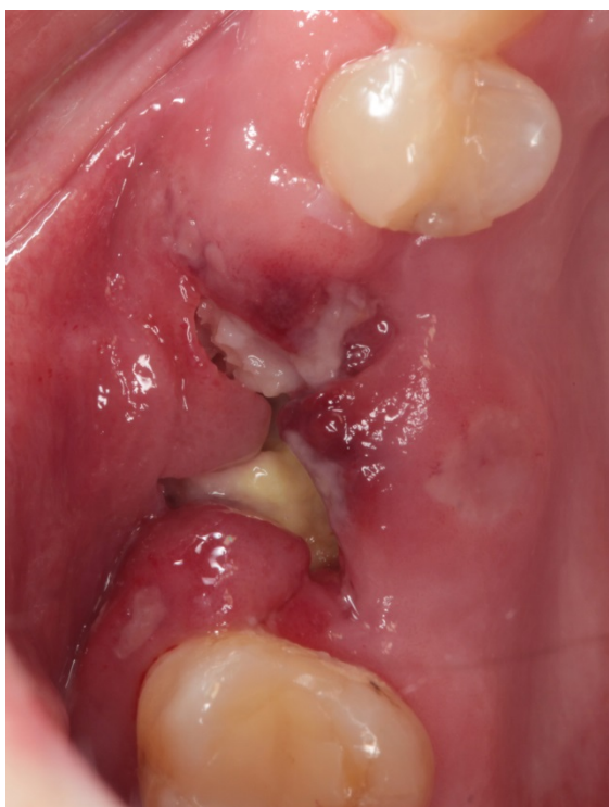
Figure 2. Mycoides fungoides. Oral manifestation of a patient with mycoides fungoides. For the cutaneous manifestations the patient had received UV A and B therapy. In addition she received interferon, radiation, and chemotherapy (Gemzar and later CHOP).