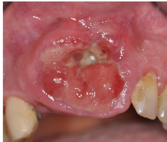
Figure 1. B-cell non-Hodgkin lymphoma. Presentation of a highly aggressive B-cell non-Hodgkin lymphoma at stage IV A. The patient's therapy was R-CHOP (cyclophosphamide, doxorubicin, vincristine, prednisolone) with an additional intrathecal triple therapy. The patient had a complete remission after 6 cycles. An additional radiotherapy of the maxilla was planned.

In the first analyzed decade from 1971 to 1980, 2 patients were identified; in the second decade 7 patients; in the third decade (from 1991 to 2000) 10 patients; in the fourth decade (2001 to 2010) 10 patients; and in the years 2011 and 2012 additional 5 patients were diagnosed.