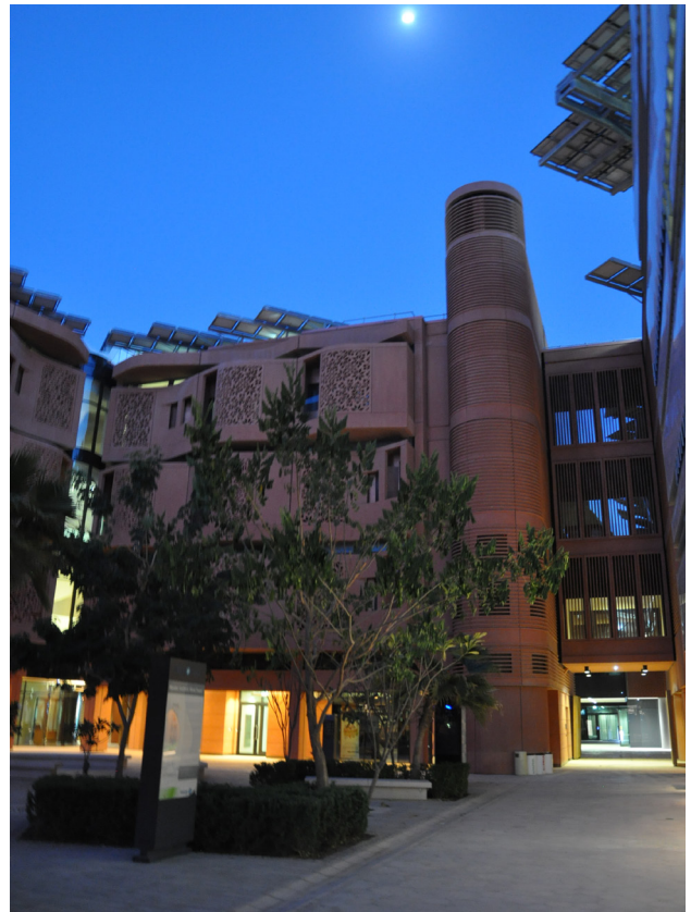
Photo 5 Masdar City, central square and 'wind-tower'.

In conclusion, the realisation of Masdar to date is much less spectacular than the grand plans and promised renderings. Masdar City is praised for advancing technological solutions in light of climate change and post-oil scenarios ( Moore et al. 2011). The architectural and engineering solutions indeed integrated passive design strategies to mitigate the energy footprint. But for all its technical advancement, the Masdar experiment did not yield innovative approaches, nor integrated solutions that were not already state of the art elsewhere in the construction industry.