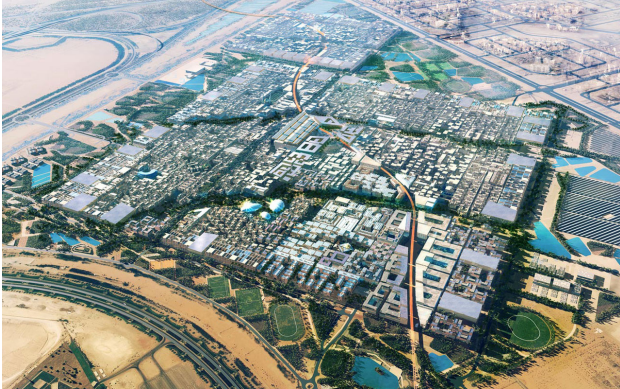
Photo 4 'Masdar Development'. Source: Foster and Partners 2017, www.fosterandpartners.com

CEO of the Masdar Initiative, said in 2007, “Masdar City will question conventional patterns of urban development, and set new benchmarks for sustainability and green design” ( BioRegional and WWF 2008 no page given).