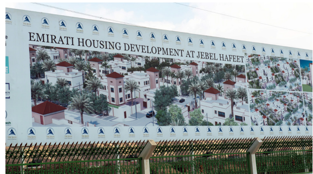
Photo 3 Billboard advertising new Emirati housing development at the foot of Jebel Hafet in Al Ain, Abu Dhabi.

and Security Planning' and 'Public Realm Design'. Critique aimed towards rigid two-dimensional 'guideline + zoning-map' concepts that further complemented the plan had already emerged in Europe by the late 1980s. The US developed a so-called 'form-based-code' in response to it by the 1990s ( Parolek 2008 ). But it was not until the 2000s that urban planning embraced sustainability rating concepts in the West: LEED (1994, USA), BREEAM (1998, GB), Minergie (1998, Switzerland), HQE (2009, France), DGNB (2009, Germany). 4 These rating systems exemplify the advancement of ecological and economic components of the sustainability discourse in Europe and the US at that time. The intersection of ecology and economy offered space for technical solutions targeted as 'eco-efficiency'.