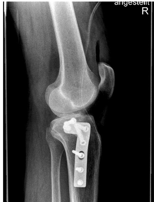
Figure 6 Postoperative lateral X-ray of the knee showing the reconstruction result.

SF-12v2 PCS and SF-12v2 MCS will be assessed as additional endpoints at visits 4 to 6, the pain measured by VAS (visits 3 to 6) as well as the intake of pain medication at visits 3 to 7. Fracture healing and integrity of the articular surface will be assessed using standard anteroposterior and lateral views of plain radiographs. The radiographs will be reviewed by the panel of two experienced orthopedic trauma surgeons and one consultant who will be blinded as to the kind of material used. The panel will independently review all radiographs in chronological order. The loss of reduction and subsidence of the articular surface will be recorded and analyzed using the Rasmussen score [17], in which articular subsidence, condylar widening, and varus or valgus deviation will be quantitatively assessed over a period of 26 weeks. In addition, the panel