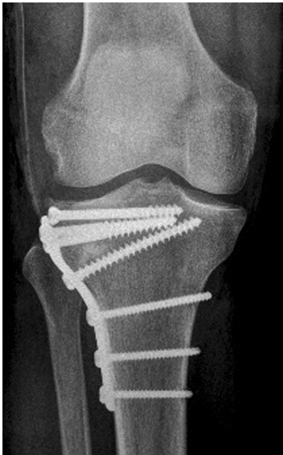
Figure 5 Postoperative anteroposterior (a-p) X-ray of the knee showing the result of reconstruction. The subchondral bone defect was filled with CBVF.

will be specific for local German conditions as this study will be performed in German centers only.