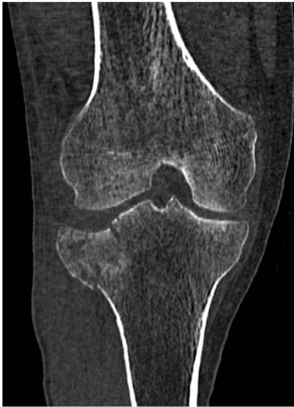
Figure 4 Coronal reconstructions of a computed tomography (CT) scan of the knee showing an AO 41 B3.1 fracture type.

criteria involve patients with more than one injury, polytrauma patients, compartment syndrome, previous iliac crest bone graft harvesting, local infection at the site of implantation, chronic pain disease, malignancy, rheumatoid arthritis, chronic cortisone therapy, unavailable X-ray diagnostics, doubtful fracture classification, and clinically significant unstable medical or surgical conditions that may preclude safe and complete study participation.