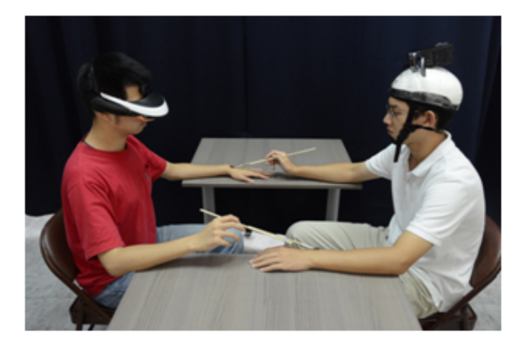
Figure 1: Experimental set-up.

chronous conditions, the average scores on WQ1 were 1.58 and 1.04 in Experiments 1 and 2 respectively, and the average scores on WQ2 were -1.03 and -0.50 in Experiments 1 and 2 respectively.