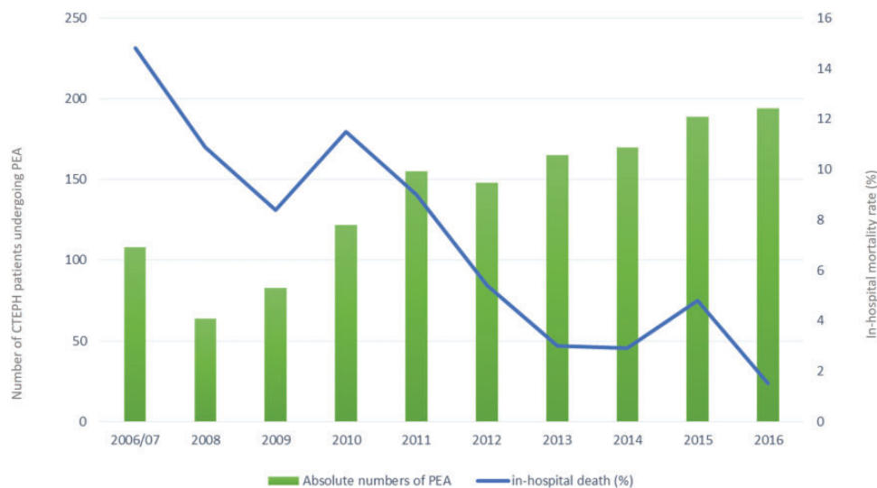
Fig. 1. Annual numbers and in-hospital mortality rate of hospitalized CTEPH patients undergoing PEA between 2006 and 2016 in Germany. CTEPH: chronic thromboembolic pulmonary hypertension; PEA: pulmonary endarterectomy.

been reported higher from 0.8 to 4.5% in retrospective studies. 21–23 Next to reperfusion lung edema, peri- and postoperative bleeding events are feared complications. 7 Our findings demonstrated less often bleeding complications such as hemopneumothorax or hemopericardium with a rate of 0.8 and 1.9%, respectively, compared to previous studies. 24,25 However, despite those bleeding events occurred rarely in the Germany NIS, the present study identified hemopneumothorax and hemopericardium independently predicting in-hospital mortality.