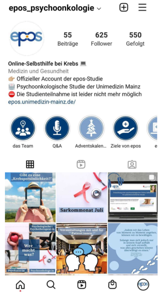
Figure 1. Instagram feed of the emotion-based psycho-oncological online self-help account.

For all participants in the epos study, registration followed the same procedure. Participants received the URL to the study home page (eg, via the flyer of the HCP or the Instagram account). On the study home page, participants were provided with the study information and registration link and could sign up for the study. After completion of the baseline questionnaire that was presented directly after registration, study participants were informed about group allocation and received access to epos or the content for the control group. More details on the registration procedure are provided elsewhere [22].